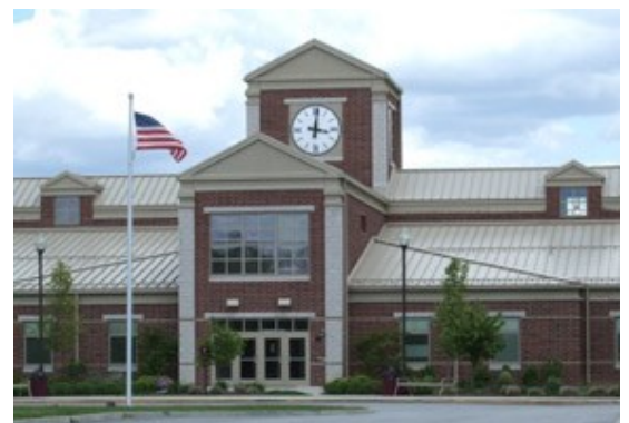
Trotwood-Madison High School